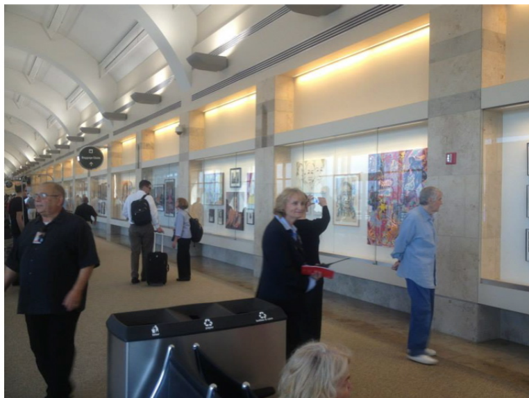
john wayne airport terminal