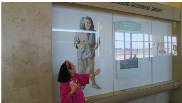
jq with portrait by stephen verona (life-size cut-out)